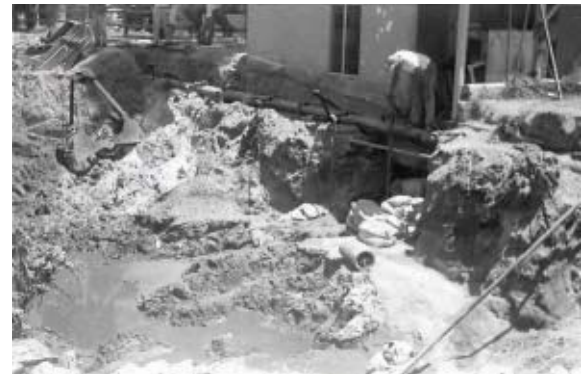
The widening of Indian Avenue in downtown Palm Springs (now North Indian Canyon Drive) at the Tahquitz intersection, shown here in various stages, began in 1953. The road's expansion covered the Hot Mineral Spring, so a holding tank, or collection ring, was built to maintain access to the water.